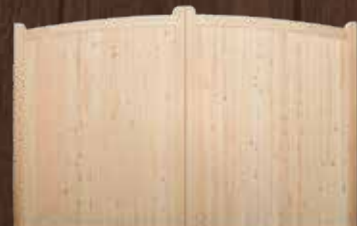
Bow Top Gate