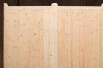
Square Top Gate