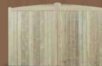
Bow Top Gate