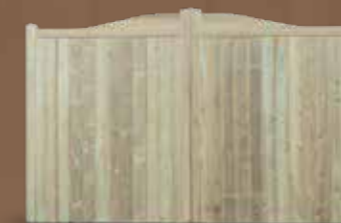
Omega Top Gate