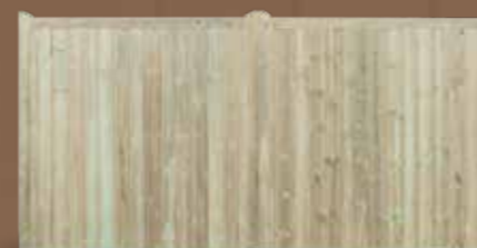
Square Top Gate

All of our driveway gates are manufactured to your exact requirements. Take your required height and overall width for the pair of gates, and calculate your price using the grid below. For intermediate sizes, please price using the next size up eg for 2.9m, use 3.0m price.