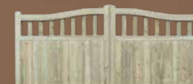
Regency Top Gate

Square Top + £0.00 Omega Top + £65.00 Bow Top + £50.00 Square Midgley Top + £120.00 Omega Regency Top + £180.00