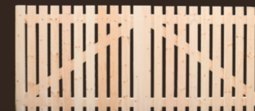
Square Top Gate

DON'T FORGET TO PROTECT ALL UNTREATED TIMBER!