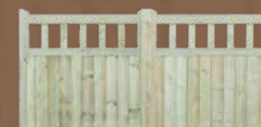
Midgley Top Gate