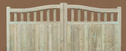
Regency Top Gate