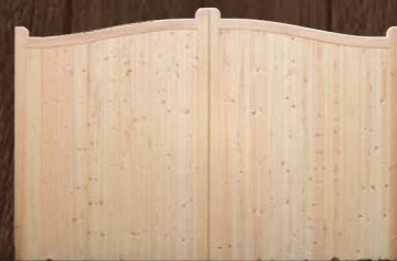
Omega Top Gate