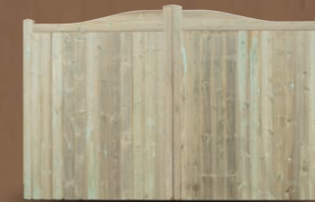
Omega Top Gate