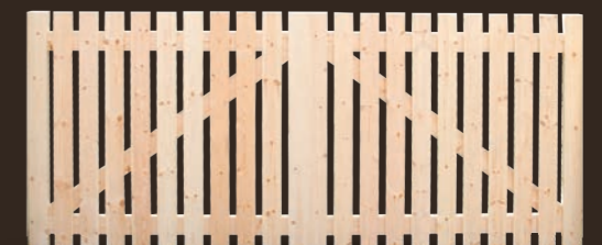
Square Top Gate

DON'T FORGET TO PROTECT ALL UNTREATED TIMBER!