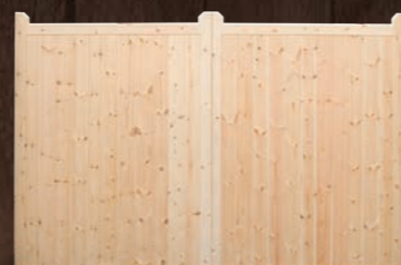
Square Top Gate