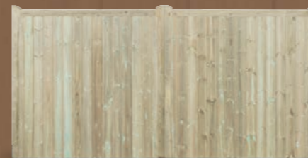
Square Top Gate

All of our driveway gates are manufactured to your exact requirements. Take your required height and overall width for the pair of gates, and calculate your price using the grid below. For intermediate sizes, please price using the next size up eg for 2.9m, use 3.0m price.