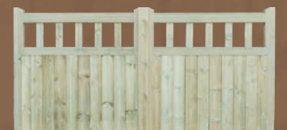
Midgley Top Gate

Square Top + £0.00 Omega Top + £65.00 Bow Top + £50.00 Square Midgley Top + £120.00 Omega Regency Top + £180.00