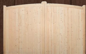
Bow Top Gate