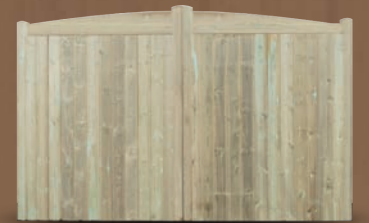
Bow Top Gate