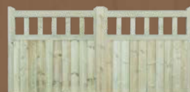
Midgley Top Gate