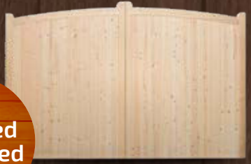
Bow Top Gate