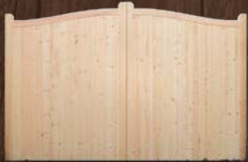
Omega Top Gate