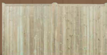
Square Top Gate