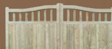
Regency Top Gate