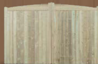
Bow Top Gate