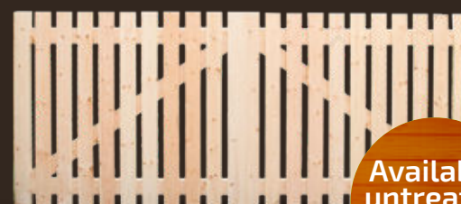
Square Top Gate