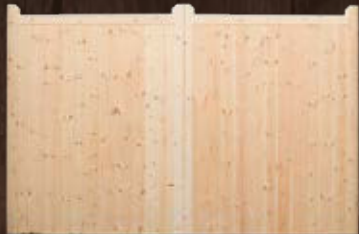
Square Top Gate

Square Top + £0.00 Omega Top + £75.00 Bow Top + £60.00 Pressure Treated Finish + £75.00