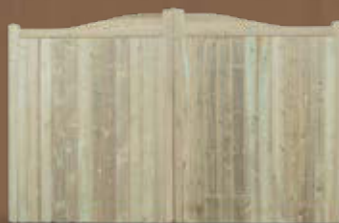
Omega Top Gate