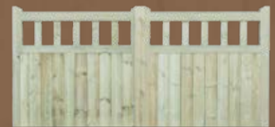
Midgley Top Gate