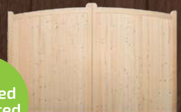
Bow Top Gate