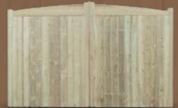
Bow Top Gate