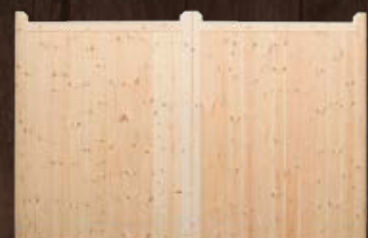
Square Top Gate

Square Top + £0.00 Omega Top + £75.00 Bow Top + £60.00 Pressure Treated Finish + £75.00