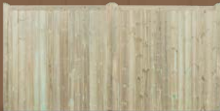
Square Top Gate