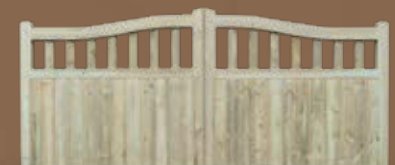
Regency Top Gate