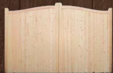
Omega Top Gate