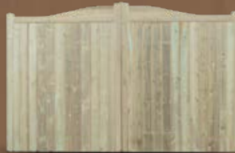
Omega Top Gate