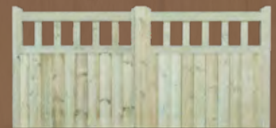
Midgley Top Gate