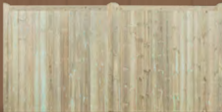
Square Top Gate