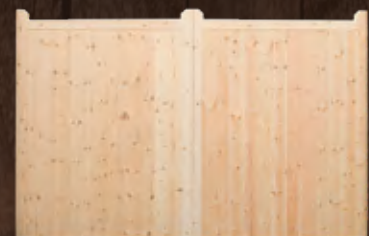
Square Top Gate

Square Top + £0.00 Omega Top + £75.00 Bow Top + £60.00 Pressure Treated Finish + £75.00