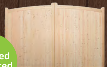
Bow Top Gate