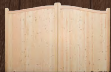
Omega Top Gate