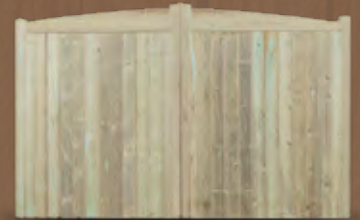
Bow Top Gate