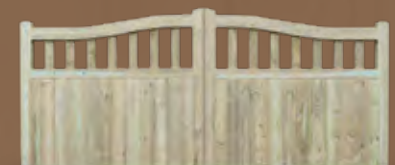
Regency Top Gate

Square Top +£0.00 Omega Top +£75.00 Bow Top +£60.00 Square Midgley Top +£120.00 Omega Regency Top +£180.00