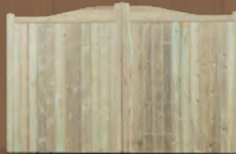
Omega Top Gate