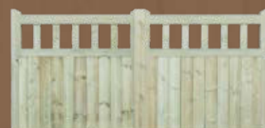
Midgley Top Gate