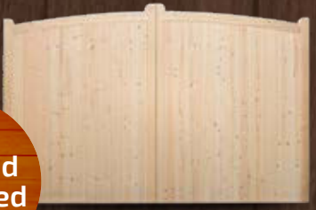
Bow Top Gate