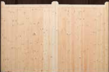
Square Top Gate