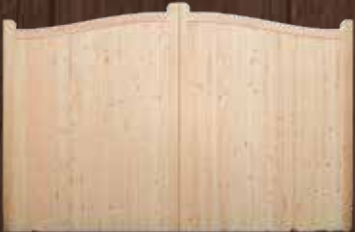
Omega Top Gate