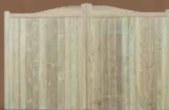
Omega Top Gate