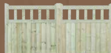
Midgley Top Gate