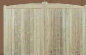
Bow Top Gate