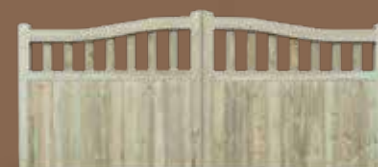
Regency Top Gate