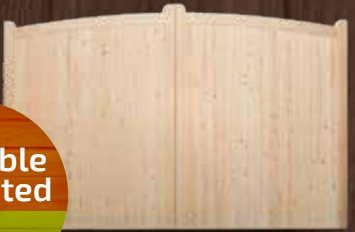
Bow Top Gate