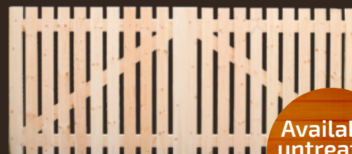
Square Top Gate